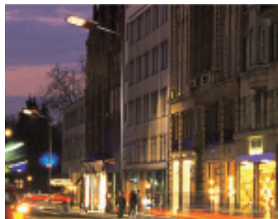
LedFX LED street light comparison with high pressure sodium lights